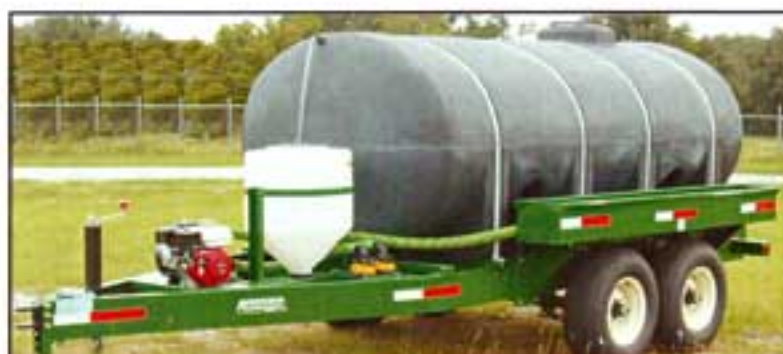
Shown with Optional Features